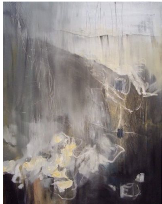
"Transplant" - SOLD Oil on Canvas 138cm x 107cm