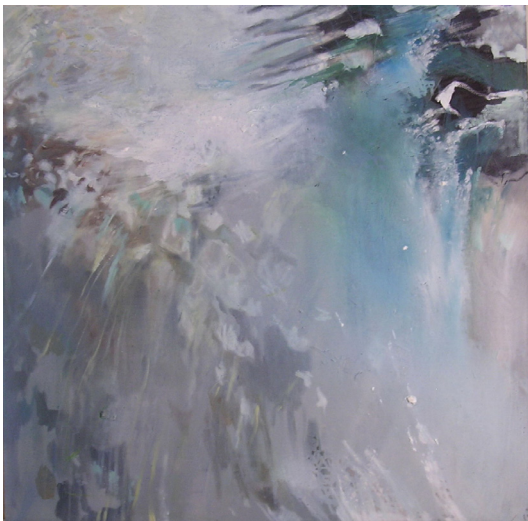
"Resting Pool" - SOLD Oil on Canvas 122cm x 122cm