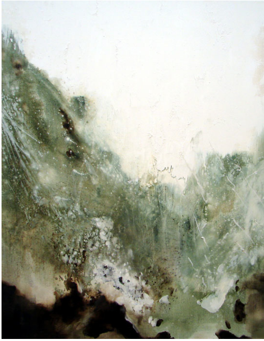
"Exile I" - SOLD Oil on Canvas 153cm x 122cm